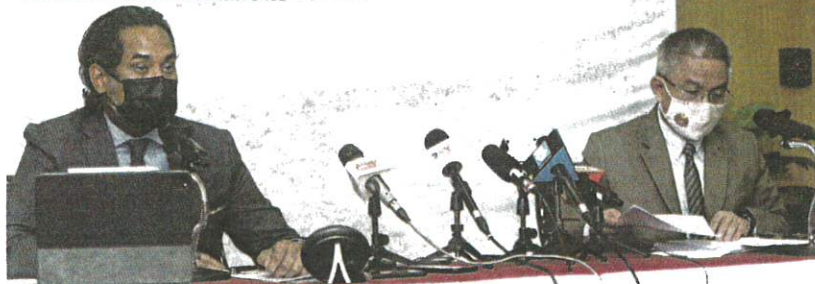
Science, Technology and Innovation Minister Khairy Jamaluddin (left) speaking at a joint press conference with Health Minister Datuk Seri Dr Adham Baba on the development of the National Covid-19 Immunisation Programme in Putrajaya yesterday.