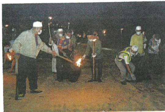
PENDUDUK di Marang, Terengganu menggunakan api jamung ketika mengutip sampah dalam program Bersih Pantal Ramadan semalam.

Ketua Pengarah Kesihatan, Tan Sri Dr. Noor Hisham Abdullah berkata, 12 kluster baharu dikenal pasti melibatkan empat kluster pendidikan termasuk dua kluster institusi pendidikan Kementerian Pendidikan, empat kluster komuniti, dua kluster