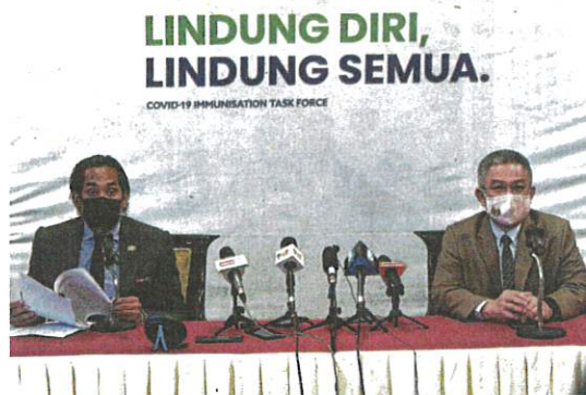
Plan of action: Khairy (left) and Dr Adham updating the media on developments in the nationwide immunisation programme.

The Science, Technology and Innovation Minister said a booking