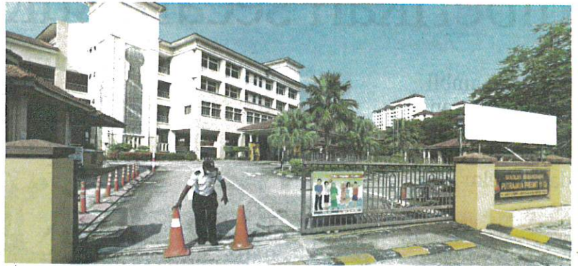
Sekolah Kebangsaan Putrajaya Presint 11 (3) diarah tutup sehingga 29 April berikutan terdapat jangkitan COVID-19 di sekolah berkenaan.

Mengulas lanjut, Dr Noor Hisham berkata, sebanyak 26,719 kes aktif direkodkan ketika ini dengan 306 kes ditempatkan di unit rawatan rapi (ICU) dan 151 me-