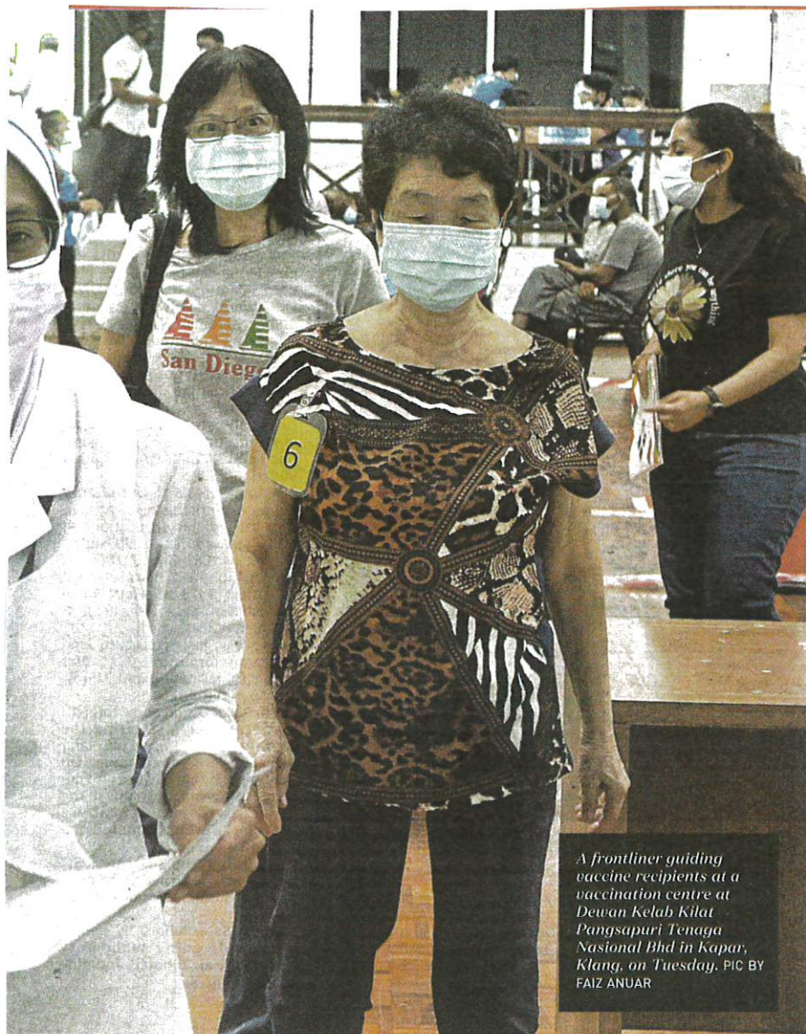
A frontliner guiding vaccine recipients at a vaccination centre at Dewan Kelab Kilat Pangsapuri Tenaga Nasional Bhd in Kapar, Klang, on Tuesday.